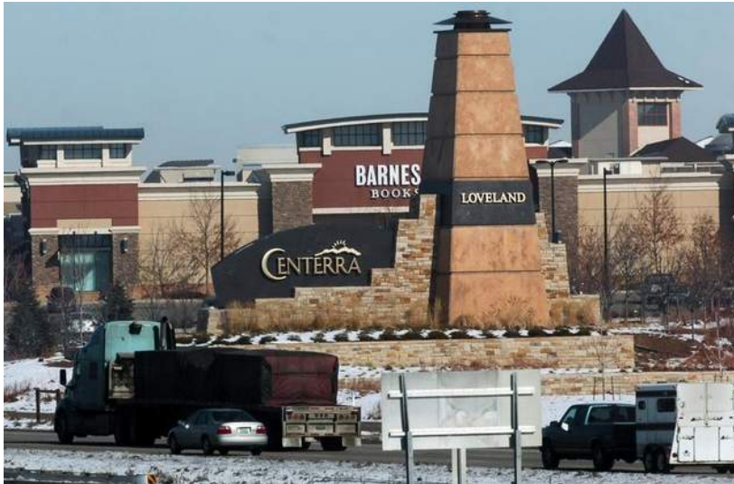
Traffic on Interstate 25 pass by Promenade Shops at McWhinney's Centerra development in this Nov. 17, 2009, file photo.

The Lakes at Centerra will offer options ranging from townhomes to custom homes on 300 acres.